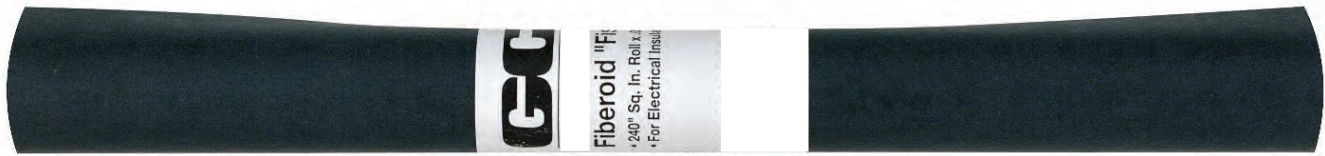
Fig. 1 Note: 0.01" ±10% Thickness